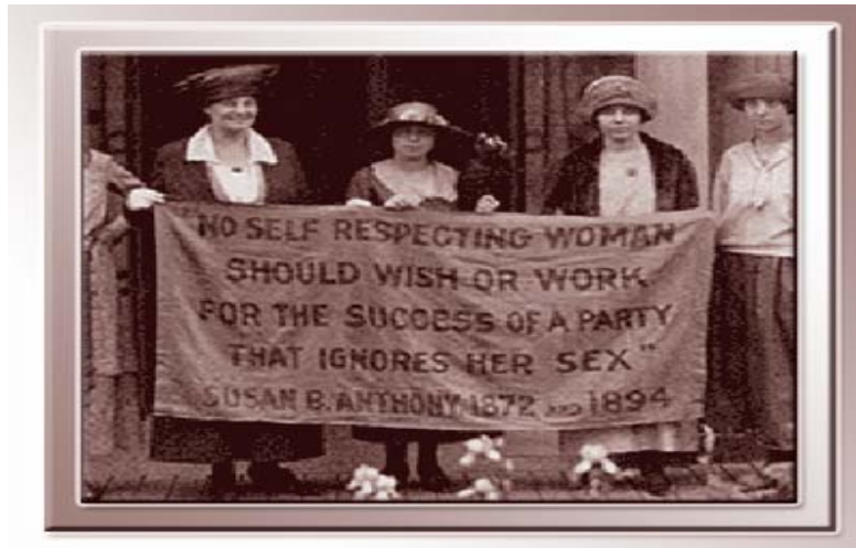
(Suffragettes march for ratification of the 19 th Amendment at the Republican National Convention in Chicago in 1920. Alice Paul, the chief organizer of the march and the author of the amendment, stands second from right.)