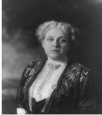
(Carrie Chapman Catt)